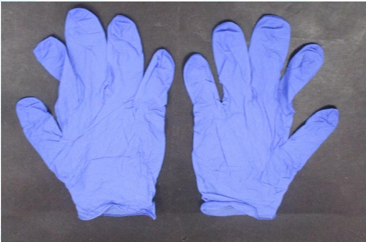
Samples described as Nitrile Examination Glove Powder Free